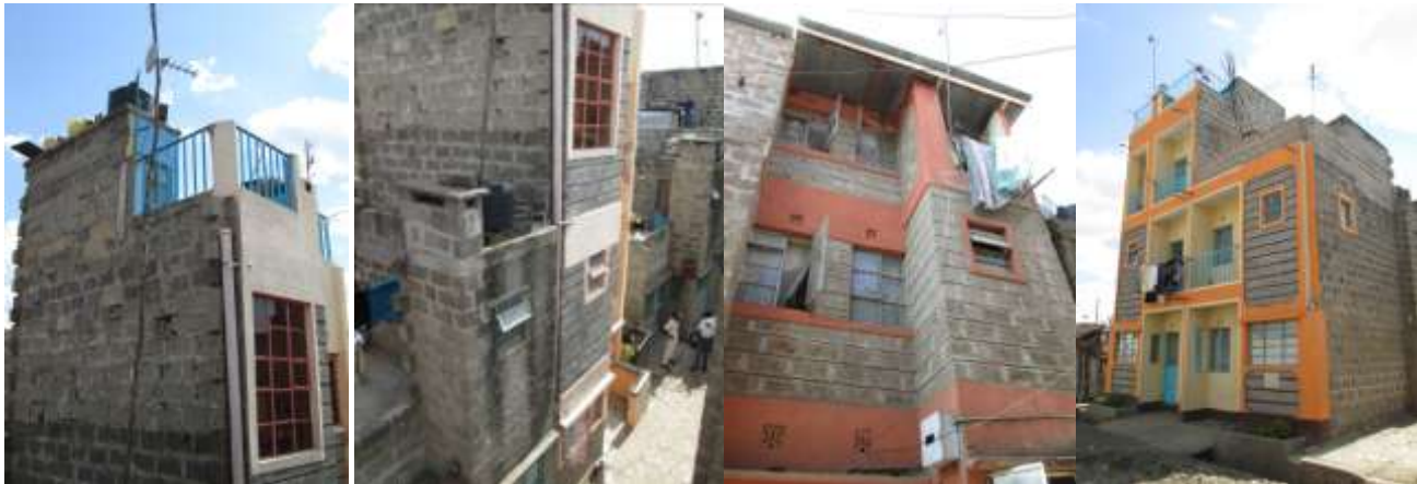
Fig. 7-8-9-10-11-12-13 Housing condition, internally and externally (, September 2012)

The project is a successful result of the partnership of Pamoja Trust and an Italian NGO COOPI into the legal framework of international cooperation promoted by European governments. Initially planned to take three years (2005-2007), the 1.5 million euro (US$2.1 million) project has stretched into 2010 due to complications, such as the post-election violence of early 2008, which affected parts of Huruma. COOPI is the project's implementing agency, with the Italian ministry of foreign affairs one of the main donors and supports the construction of the infrastructure while Pamoja Trust, the local NGO, provides social and technical support.