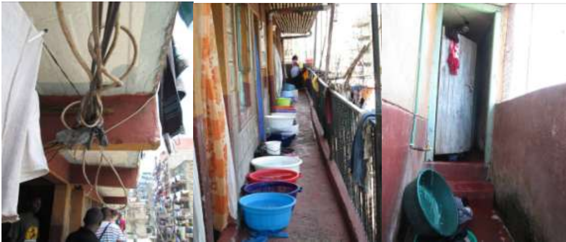
Fig 8-9-10 Electricity, water supply and toilets are not provided by the landlord

Due the absence of ordinary electricity connections the residents need to organize an informal connection. Water supply is not guarantee into the units and need to be organized through one pipe for floor located near the one 2 bathrooms per floor available for the residents.