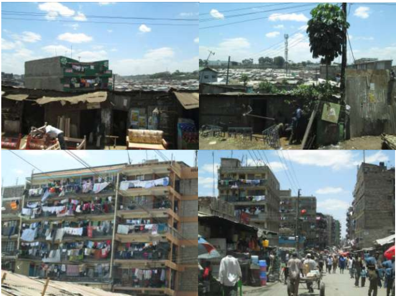
Fig 1-2-3-4 Housing tipology in Mathare

“Mathare Valley is a part of Mathare slum located few kilometers from the centre of Nairobi. The Valley is one of the oldest and worst slum areas in Nairobi and the degree of poverty there is unimaginable. People live in 6 ft. x 8 ft. shanties made of old tin and mud. There are no beds, no electricity, and no running water. People sleep on pieces of cardboard on the dirt floors of the shanties. There are public toilets shared by up to 100 people and residents have to pay to use them. Approximately 600,000 people live in an area of three square miles. Most live on an income of less than a dollar per day. Crime and HIV/AIDs are common”. http://en.wikipedia.org/wiki/Mathare_Valley