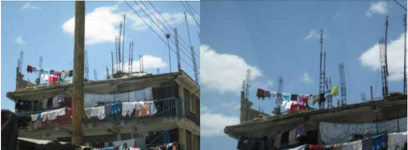
Fig 1-2-3- Despite the precarious conditions homes continue to be enlarged and floors o be added ( photo by Laura Burocco, September 2012 )