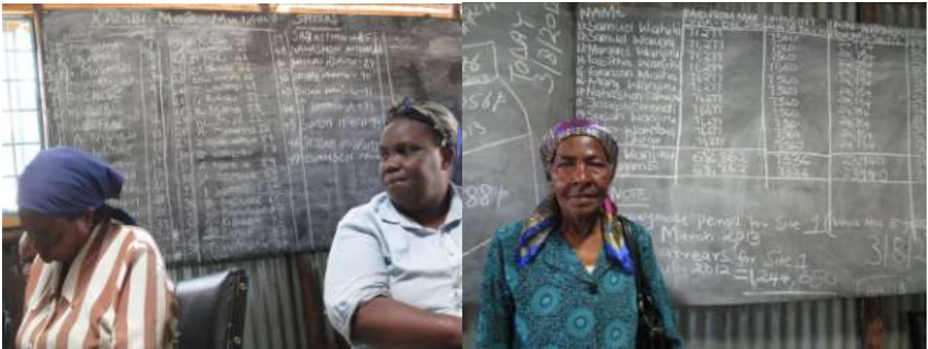
Fig. 3-4 Despite someone allege that poor communities are too disorganize to mobilize resources to put up their own structures the Moto Kambi Project demostre high level of organization and management capacity