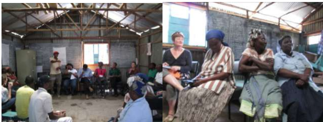
Fig 1-2, Meeting with the members of the Kambi Moto Hosuing Project, Huruma

“The housing project Kambi Moto started in 2003, the residents started making daily saving based on an individual member’s ability. Some contribute as little as ten shilling daily. Trough the support of Pamoja Trust and Akiba Mashinani Trust each member was required to save at least 10% of the initial cost of constructing ground floor, a called starter house. This translated into about 7 thousand and 5 hundred shillings. The group through group saving also loaned the member another 10% while Akiba Mashinani Trust loaned the remaining 80%. The beneficiaries started repaying their loans as soon as they occupied the starter houses. 86 members have completed their houses and 56 more units are under construction and will be ready in the next few months”. Realizing Right s Though Practice, annual campaign 2012. Published by Pamoja Trust , pp.53-54