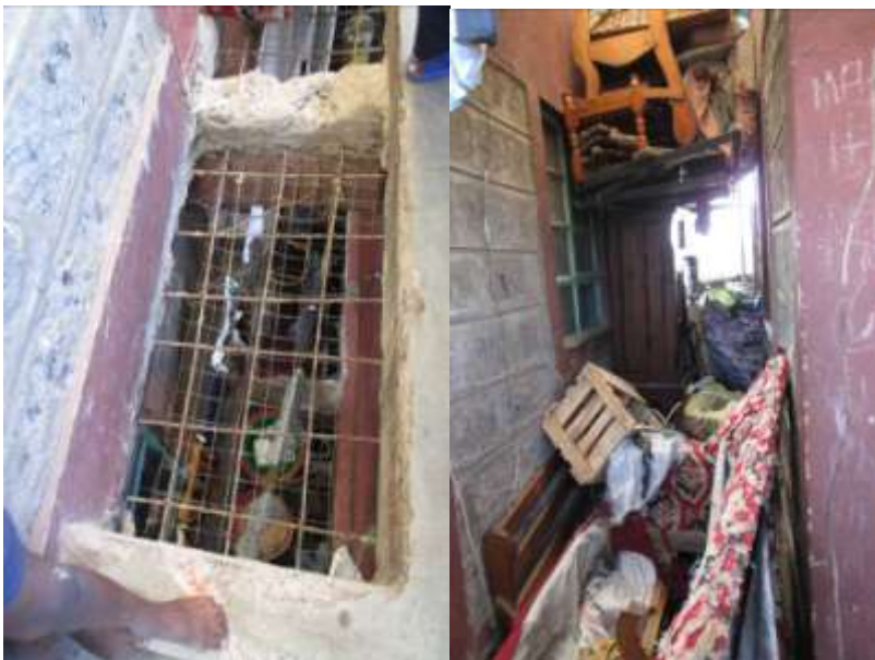
Fig 4-5 Internal and esternal corridors in the building we visited

The only form of ventilation provided in the interior corridor is a open grid present in the pavement of each floor which should facilitate the air's circulation. This type of system, in addition to being dangerous, given the presence of many children in the corridors, is ineffective due to the obstruction of these ventilation routes, used by residents as a storage due to the lack of space in individual units